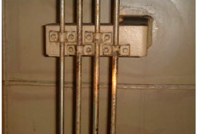
VRC tube in Cargo Tank 2