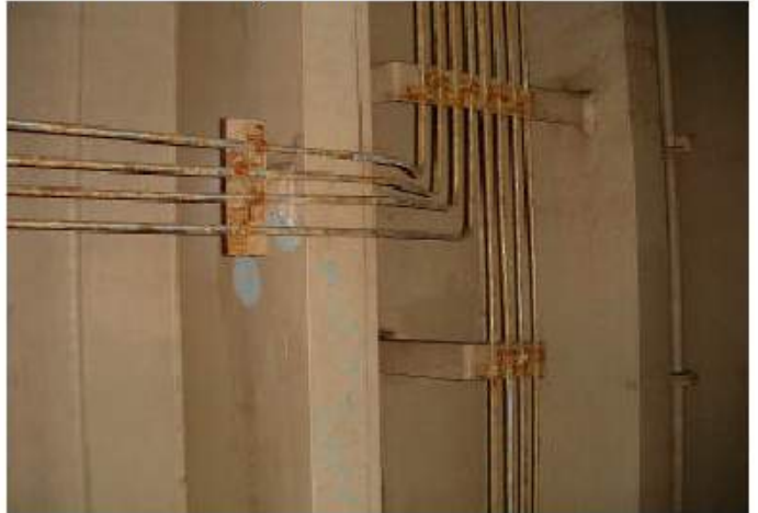
VRC tube in Cargo Tank 4