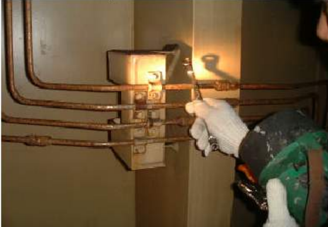
VRC tube in Cargo Tank 1