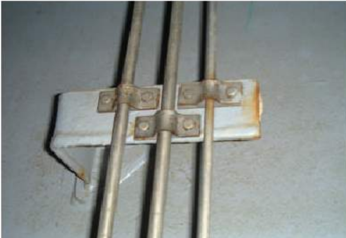
VRC tube in Ballast Tank 1